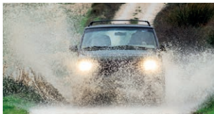
Millbrook, Bedfordshire, UK (Defensive Driver training only)