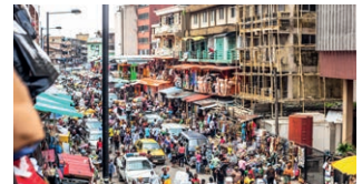
Lakowe Lakes, Lekki, Lagos, Nigeria