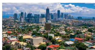
Fontana Hotel, San Fernando, Manila, Philippines