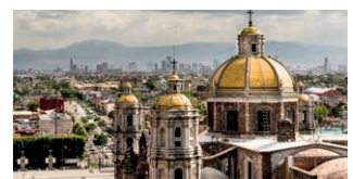
Autodromo Moisés Solana, Mexico City, Mexico