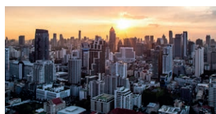
Swartkops Raceway, Johannesburg, South Africa Hatta Fort, Dubai