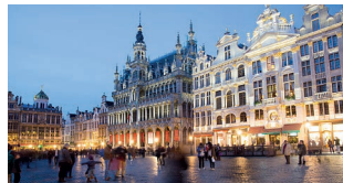
Hainaut Sécurité, Mons, Belgium