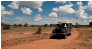
Maanzoni Lodge, Lukenya, Nairobi, Kenya