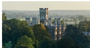
Shuttleworth Estate, Bedfordshire, UK